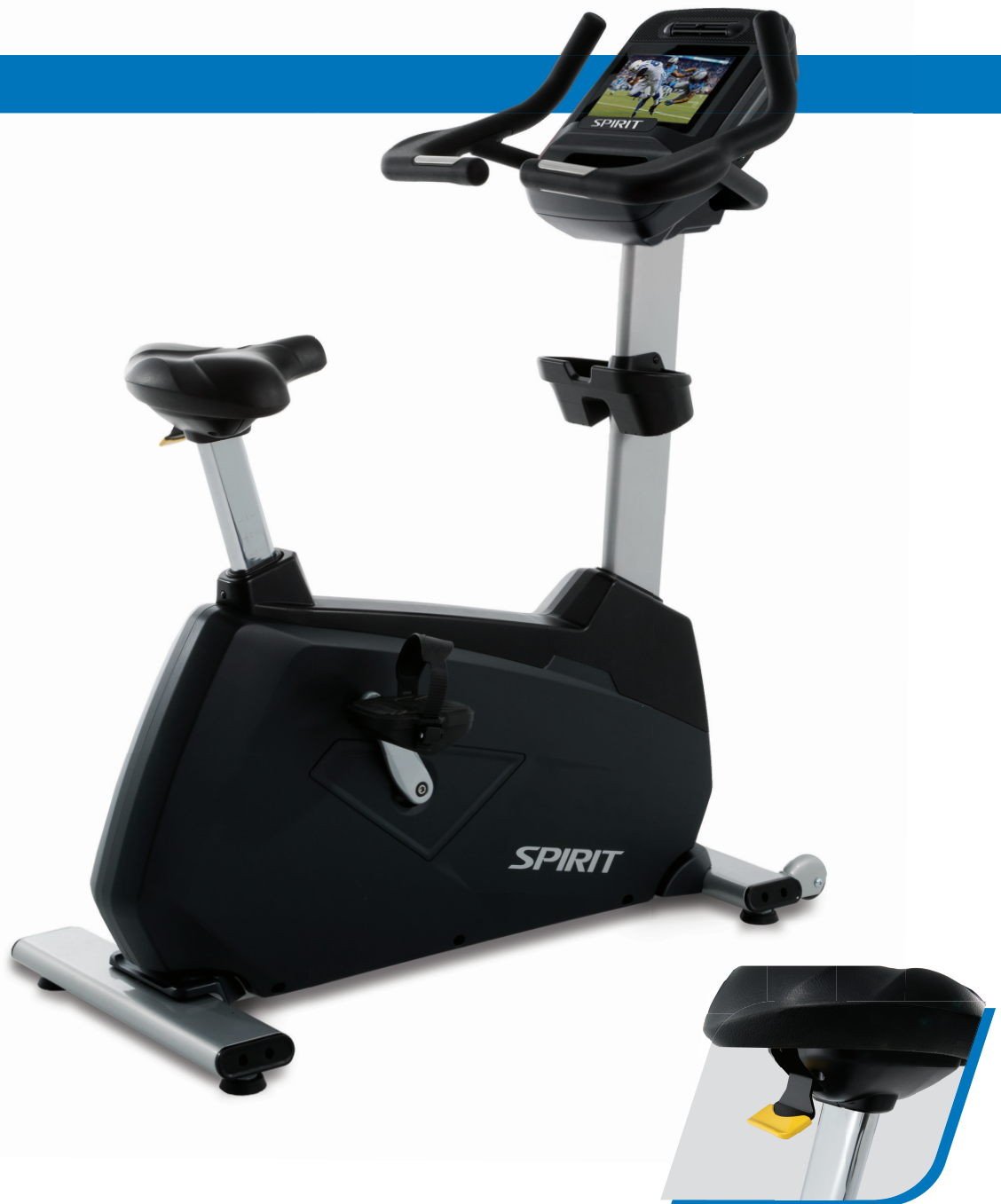
Easy Seat Adjustment

Users get the best of both in motivation and entertainment with the CU900ENT Upright Bike. The 10.1" touchscreen display allows users to watch TV, surf the internet and stream music while they work out. Three workout display modes give users plenty of feedback on their performance and progress. Commercial-grade pedals, cranks and bearings provide outstanding function and durability.