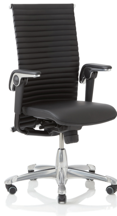
Design: Svein Asbjørnsen/sapDesign@. Patent- and design protected.